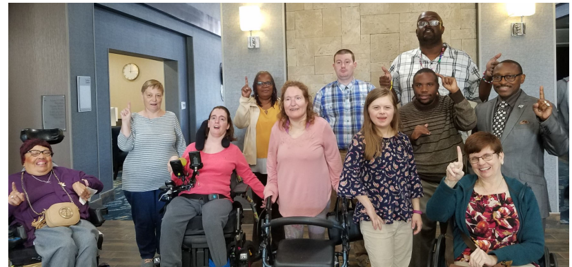
Members of SAU1's Power Board and Staff take a break from the Fall 2019 board meeting with fingers raised to show they are united as 1.

Join us to talk about services, issues, and Covid. Get the answers you need to speak up and live your life, your way. Call or email us by Jan. 6 with your questions and comments, and we'll share them with ODP.